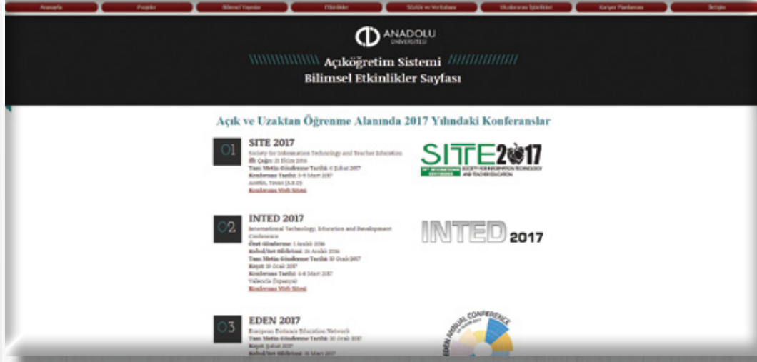
International Open and Distance Learning Conferences in 2017

The links to “Glossary of Open and Distance Learning”, including concepts and terms related to open and distance learning, and “Patents for Papers”, an international database, are available under “Glossaries and Databases”.